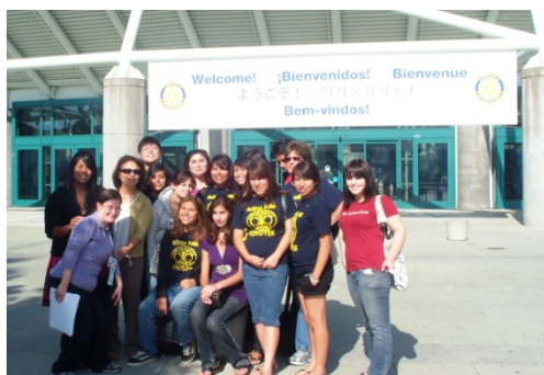
Buena Park Interactors attend the LA2008 RI Convention