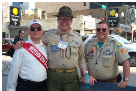
IFRS at 2005 RI Convention