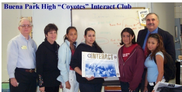
Buena Park High "Coyotes" Interact Club