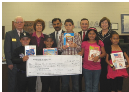
Literacy Donation at Buena Park SD