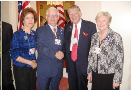
Salts's and Kerry's in 2008