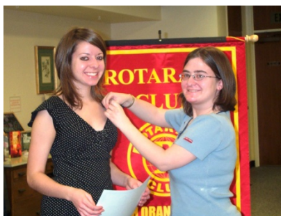
Pinning Rotaract President